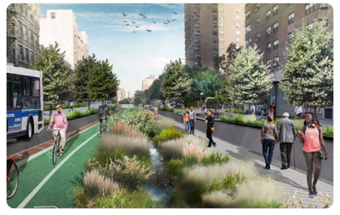
One of the team's proposed pilot projects to combat the bathtub effect in East Harlem was an integrated stormwater management/green infrastructure project along 106th Street paired with a reconfiguration of the right-of-way to better accommodate pedestrians, cyclists, and buses.